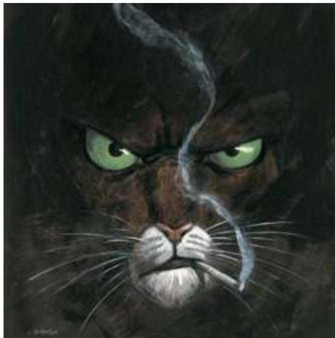
Blacksad, 2000