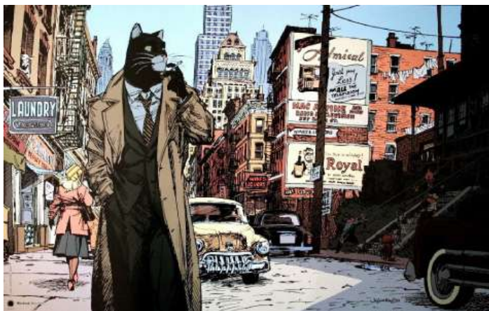
Blacksad, 2000 © Juanjo Guarnido, courtesy of Éditions Dargaud