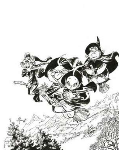
Brujeando, 2015

In addition, there are videos about biographical and creative aspects of Juanjo Guarnido which guide us to know him even more.