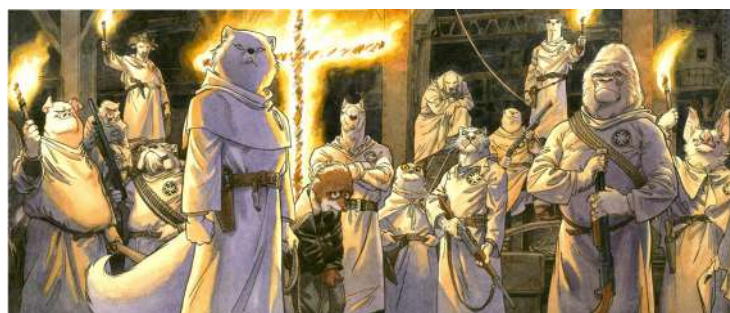
Blacksad, 2003