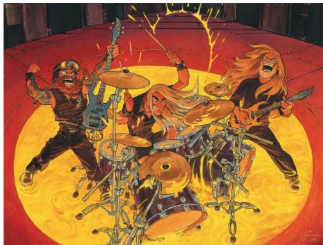
Freaky Project, 2015 © Juanjo Guarnido