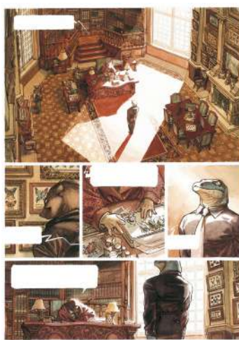
Blacksad, 2000 © Juanjo Guarnido, Cortesy of Éditions Dargaud