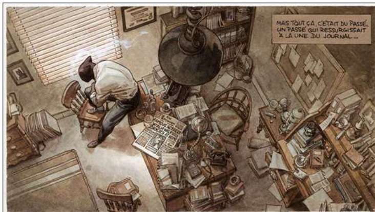
Blacksad, 2000 © Juanjo Guarnido, courtesy of Éditions Dargaud