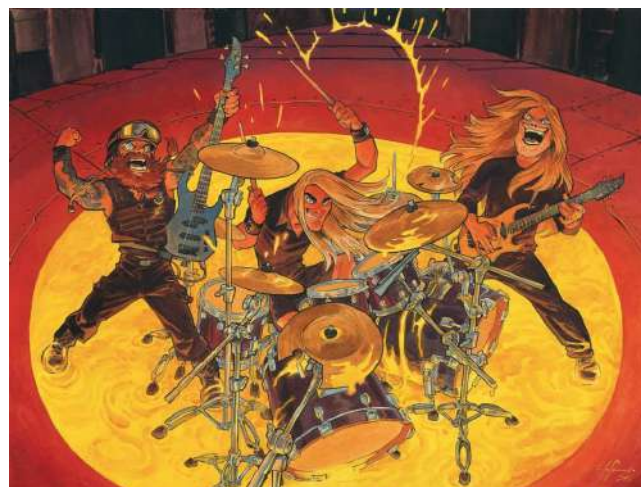
Freaky Project, 2015 © Juanjo Guarnido