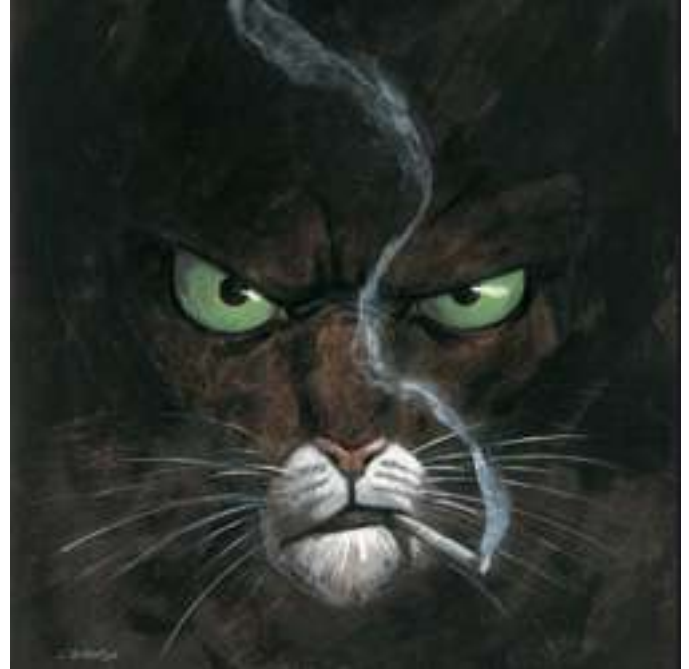
Blacksad, 2000 © Juanjo Guarnido, courtesy of Éditions Dargaud