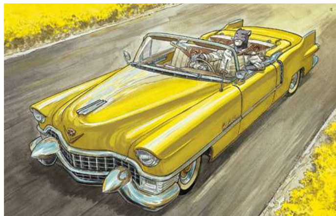
Blacksad, 2000 © Juanjo Guarnido, courtesy of Éditions Dargaud