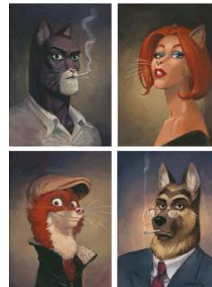
Blacksad, 2003 © Juanjo Guarnido