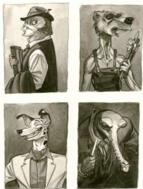
Blacksad, 2005 © Juanjo Guarnido, courtesy of Éd. Dargaud