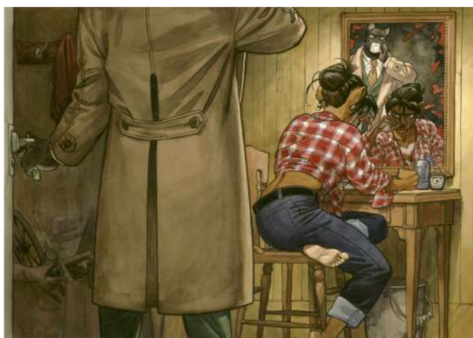
Blacksad, 2010 © Juanjo Guarnido, courtesy of Éditions Dargaud