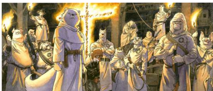
Blacksad, 2003 © Juanjo Guarnido, courtesy of Éditions Dargaud