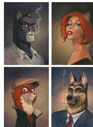
Blacksad, 2003 © Juanjo Guarnido, courtesy of Éditions Dargaud