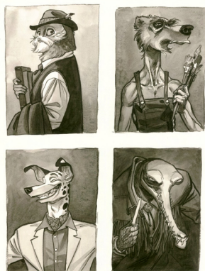
Blacksad, 2005 © Juanjo Guarnido, courtesy of Éd. Dargaud