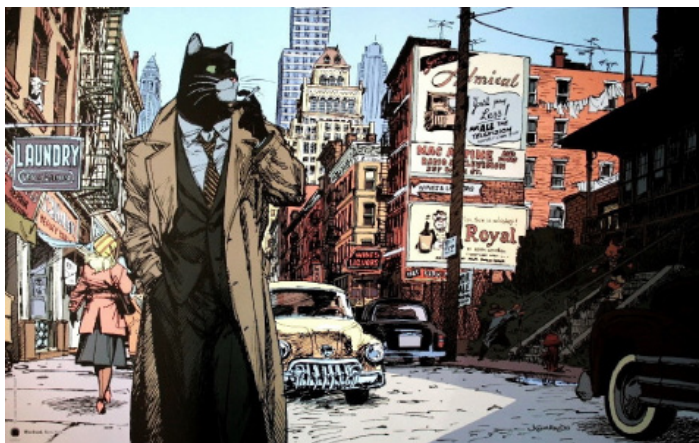
Blacksad, 2000 © Juanjo Guarnido