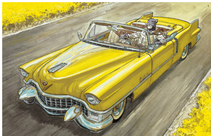
Blacksad, 2013 © Juanjo Guarnido, courtesy of Éditions Dargaud