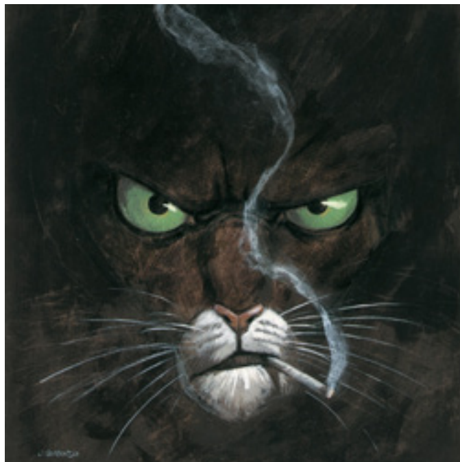
Blacksad, 2000