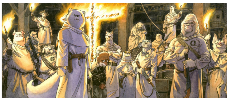
Blacksad, 2003 © Juanjo Guarnido, cortesía of Éditions Dargaud