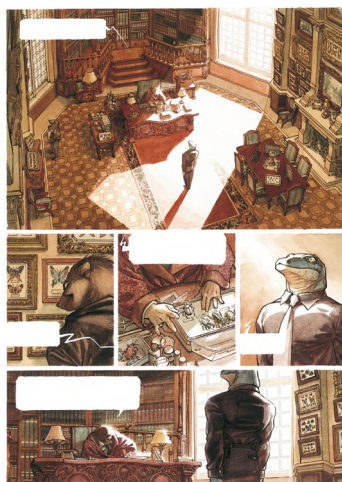
Blacksad, 2000 © Juanjo Guarnido