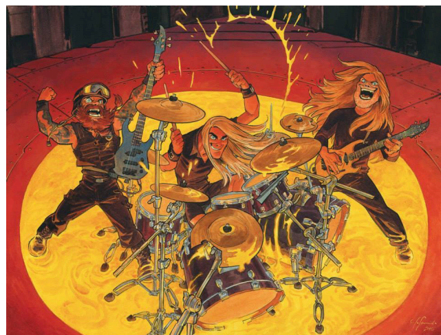
Freaky Project, 2015 © Juanjo Guarnido