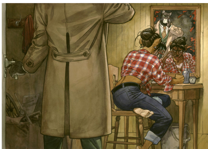
Blacksad, 2010 © Juanjo Guarnido, courtesy of Éditions Dargaud