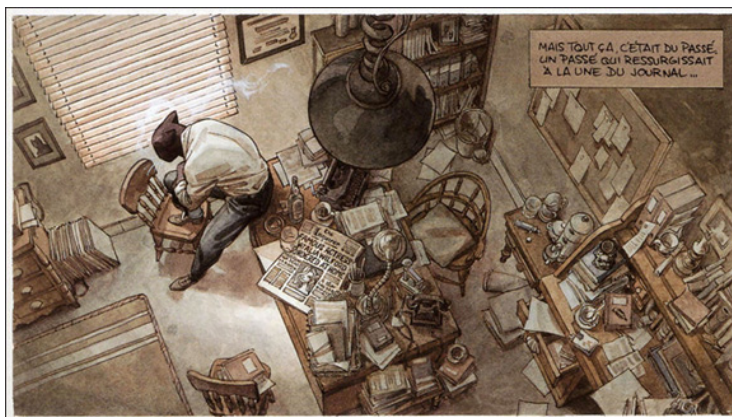
Blacksad, 2000 © Juanjo Guarnido, courtesy of Éditions Dargaud