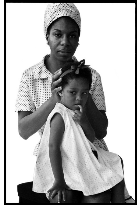
Nina Simone and daughter, 1965

present day: Elvis Presley, Buddy Holly, Johnny Cash , Aretha Franklin, Stevie Wonder, The Beatles, The Rolling Stones, The Beach Boys, Jimi Hendrix, Janis Joplin, The Doors, Eric Clapton, Bob Dylan, Leonard Cohen, The Who, Pink Floyd, David Bowie, The Velvet Underground, Iggy Pop, Roxy Music, Queen, Motörhead, AC / DC, Neil Young, Bruce Springsteen, Tom Waits, Kraftwerk, Sex Pistols, The Ramones, Joy Division, The Clash, U2, Blondie, The Cure, Prince, REM, Björk, Nick Cave, Michael Jackson, Madonna, Sonic Youth, Beastie Boys, Oasis, Nirvana, Marilyn Manson, Amy Winehouse, Kanye West..., and so on up to a hundred bands and musicians.