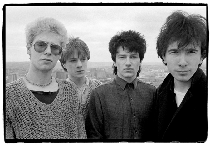
U2 on the roof of the Cork Country Club Hotel, Cork, Republic Of Ireland, 2 March 1980