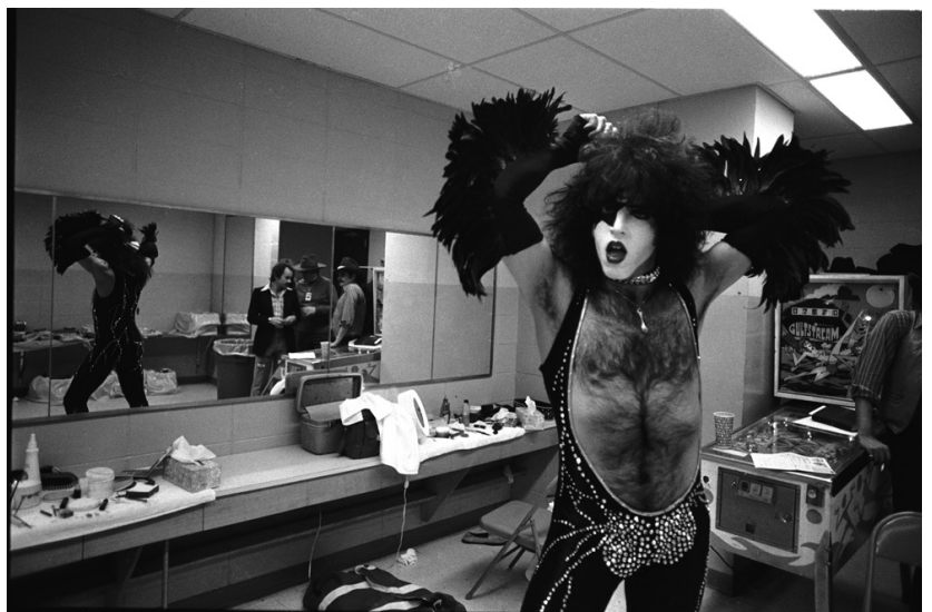
The Kiss. Paul Stanley from Kiss, New York 1977