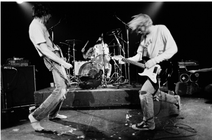
Nirvana, Commodore Ballroom, Vancouver, 1991