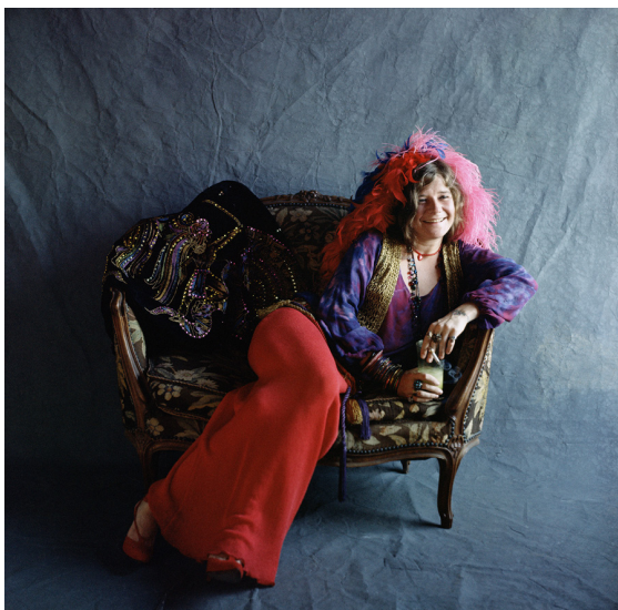
Janis Joplin, Hollywood, 1970. Cover Photograph for the album Pearl

Conceived as a chronicle of the History of Rock through the lenses of those best photographers of the 20th century, the exhibition is a chronological journey from the beginnings of rock and roll history to the