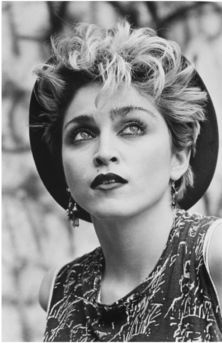
Madonna, NYC 1982