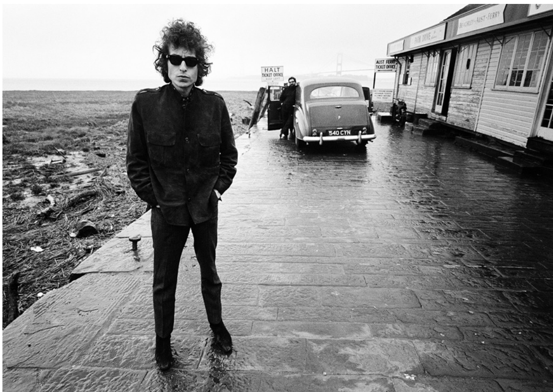
Bob Dylan, Aust Ferry, Bristol, England, 1966

This show combines photography and music, two disciplines that have always lived in a permanent symbiosis, and includes the mythical and well-known images of 100 myths in the History of Rock music through the lenses of 40 best-known photographers.