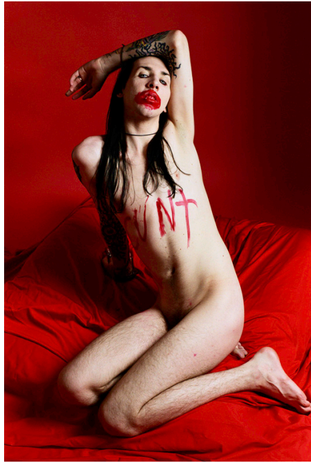
Marilyn Manson, 1994