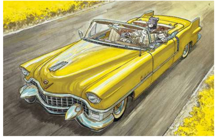
Blacksad, 2013 © Juanjo Guarnido