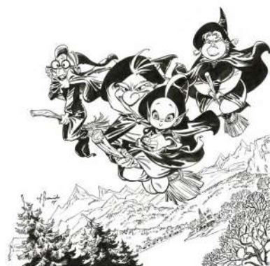
Brujeando, 2015

In addition, there are videos about biographical and creative aspects of Juanjo Guarnido which guide us to know him even more, until his last work “Les Indes Furbes”.