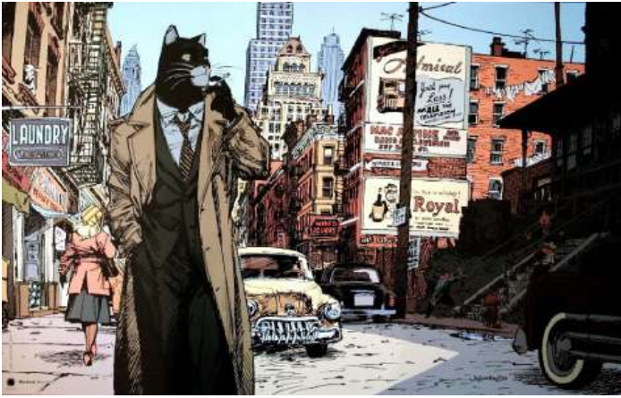
Blacksad, 2000 © Juanjo Guarnido, courtesy of Éditions Dargaud