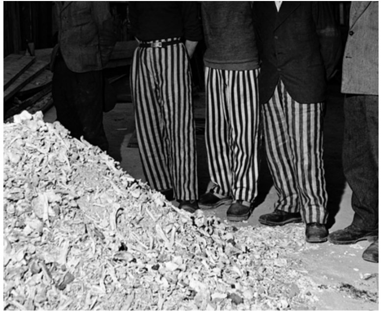
Detail of released prisoners in striped prison dress beside a heap of bones from bodies burned in the crematorium, Buchenwald, 1945