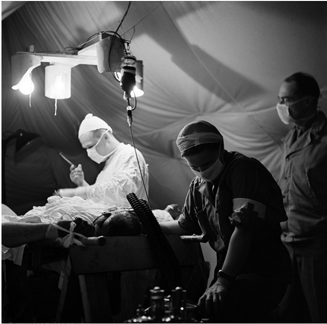
Surgeon and anaesthetist, Normandy, 1944