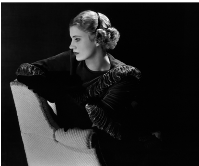
Self portrait with headband, New York, c. 1932

La Termica presents a retrospective show of Lee Miller, one of the most relevant photographer of the 20th Century. The exhibition includes more than 100 images.