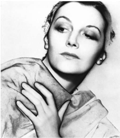
Solarised Portrait, Paris, 1932