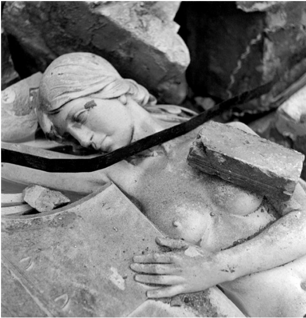
Revenge on Culture, London, 1940