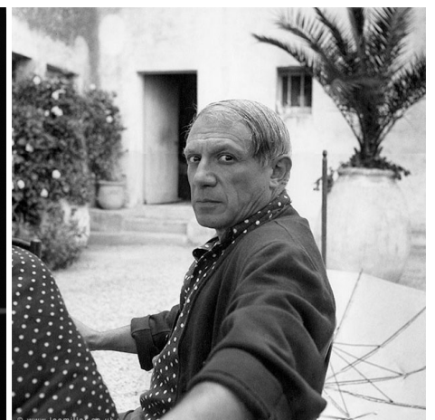
Picasso, Mougins, 1937