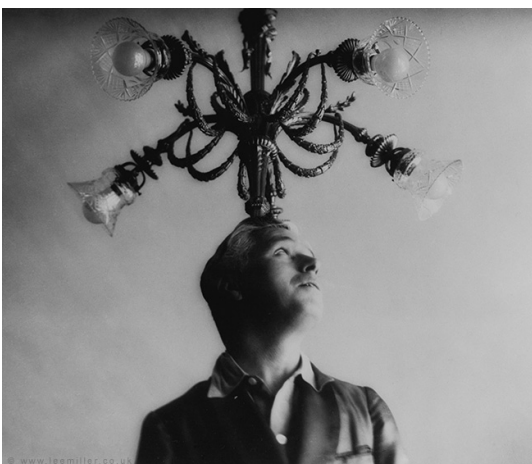
Charlie Chaplin with light fixture, St. Moritz, 1932

After a few years, she decided to move to the other side of the camera. In 1929 she moved to Paris to work with the well-known artist and photographer Man Ray. She became Man Ray’s model and muse, and that led to a strong artistic collaboration between the two. Together, they took some of the most beautiful shots of the period and made important technical developments in photography such as the artistic application of the Sabattier effect.