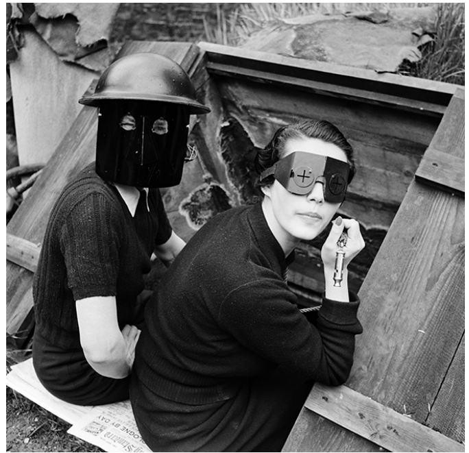
Fire Masks, London, 1941