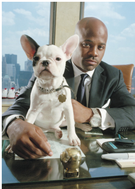
Damon Dash, 2005