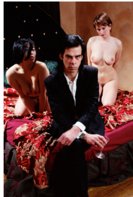
Nick Cave, 1996