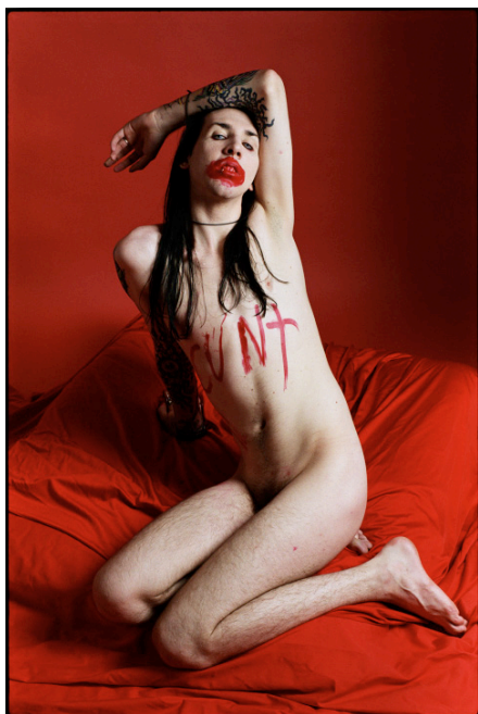
Marilyn Manson, 1994

Kern is a regular contributor to Vice and Purple and has published 11 books, some of them with Taschen. His films and photographs have been exhibited at MOMA, The Whitney Museum and in more than 30 solo shows around the world. Some of his most memorable films are 'Right Side of My Brain' (1984), 'Fingered' (1986), 'Submit to me Now' (1987) and 'Clean' (2011). Kern has shot music videos for artists such as Marilyn Manson ('Lunchbox'), King Missile ('Love Is...'), The Breeders ('Divine hammer'), Sonic Youth ('Death Valley '69'), and Is Tropical ('Lover's Cave').