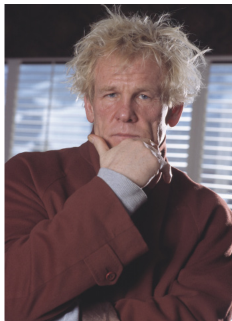
Nick Nolte, 2000

Transgression, underground, celebrities, art, poetry, fiction and crude reality swarm through the cracks of “Richard Kern. Naked and Famous” images and trying to seep trough our retina in order to change our way of focusing the human figure.