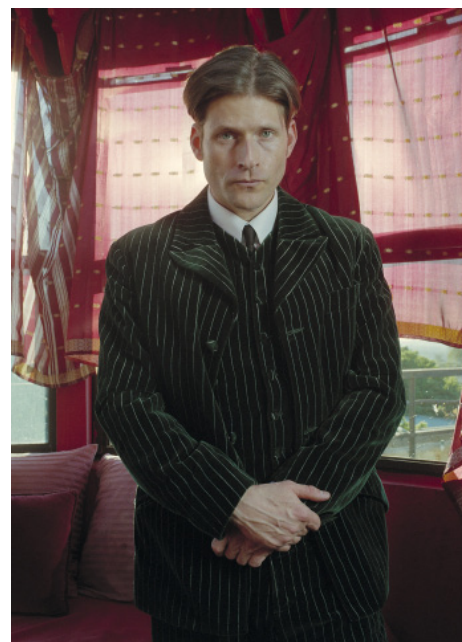
Crispin Glover, 2005