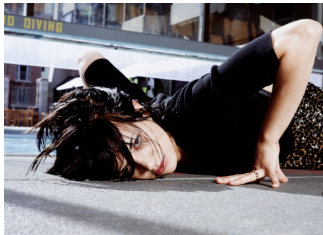
Asia Argento, 2000